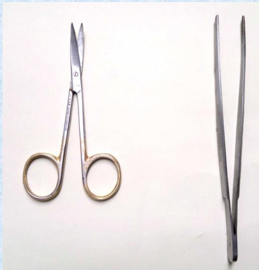
Gold-handled, curved fine-tipped Scissors