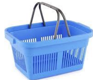
Plastic basket x 01

Approx.. 30cm x 8cm (to fit in to the small plastic tray – with or without a handle x 01)