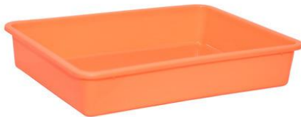
Plastic tray aprox. 45cmx30cm -01