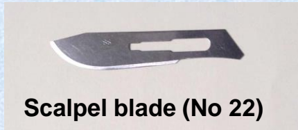
Scalpel blade (No 22)