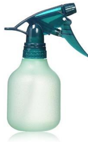
Spray bottle 250-500ml x 01

Approx.. 30cm x 8cm (to fit in to the small plastic tray – with or without a handle x 01)